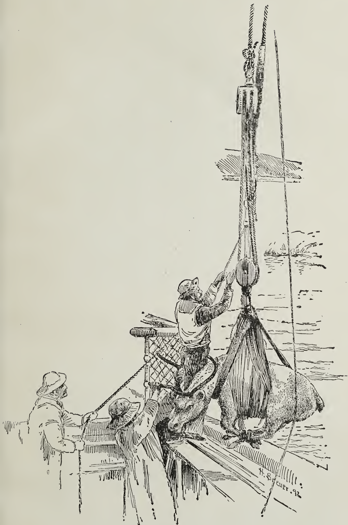
Hoisting in a Reindeer on Board the Bear